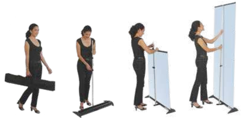
Tool Free Assembly!