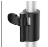
G Lock allows quick height adjustments.

Tremendous value & still made in the USA!