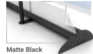
Matte Black Lightweight, portable No loose parts to lose