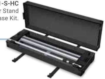
RY1-S-HC Banner Stand w/ Hardcase Kit.

Specify: Color* -S Satin Silver or -B Matte Black