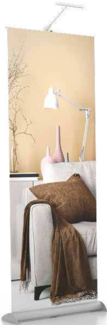
RY1-S with LEDBR1 light.