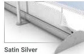
Satin Silver Sleek new styling Assemble without tools

Case Dimensions: 43" w x 14.5" d x 5" h, adds 13 pounds. The above are cases & inserts only - No Banner Stands.